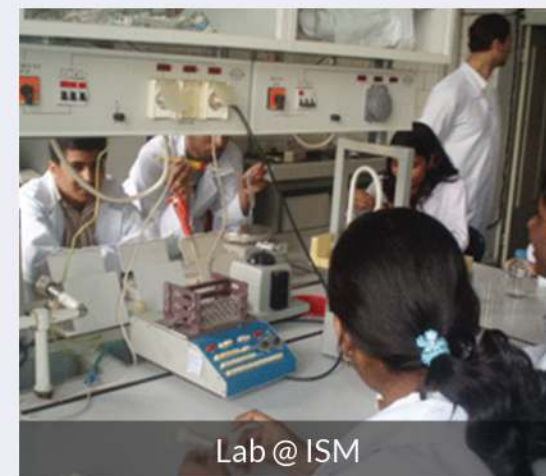
Lab @ ISM