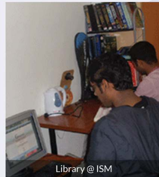
Library @ ISM