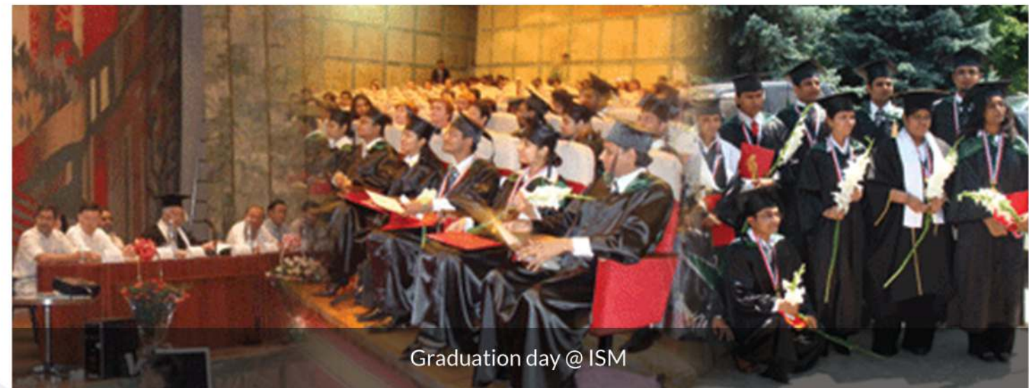
Graduation day @ ISM